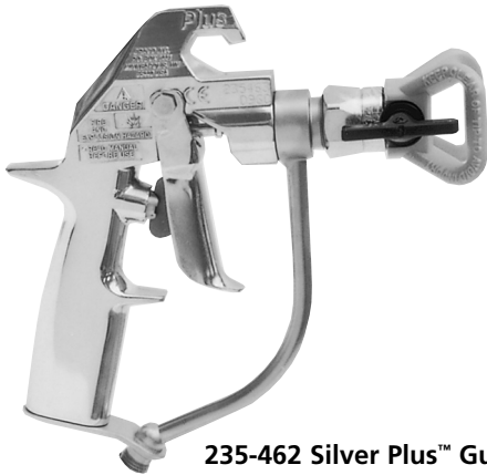
235-462 Silver Plus™ Gun